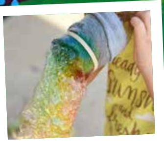
Bubble - O - Fun