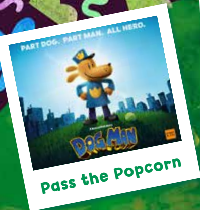
Pass the Popcorn